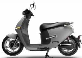
GREY MAT FINISH