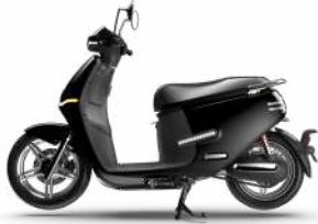
BLACK MAT FINISH